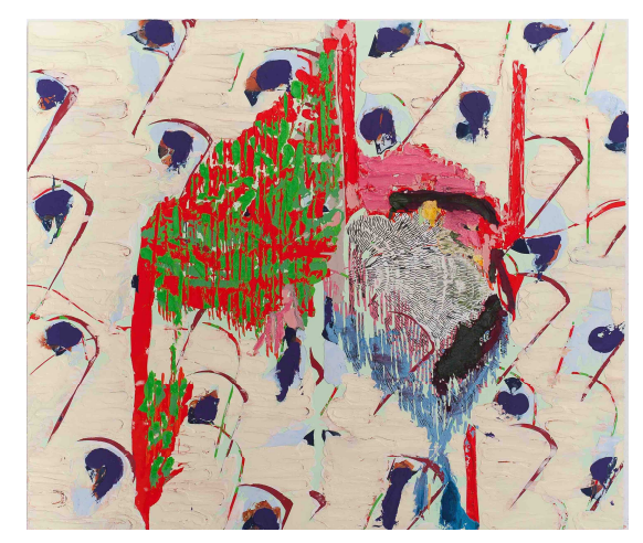
Sans titre, 2017 Courtesy Martos Gallery (New York)