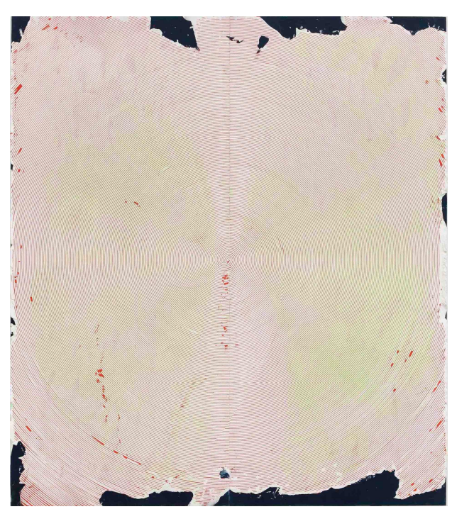
Sans titre, 2016