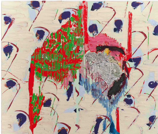
Sans titre, 2017