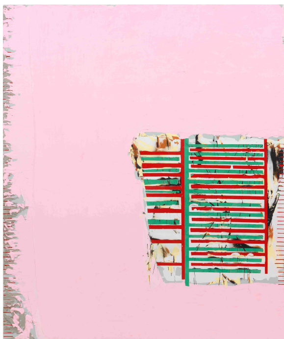
Sans titre, 2016