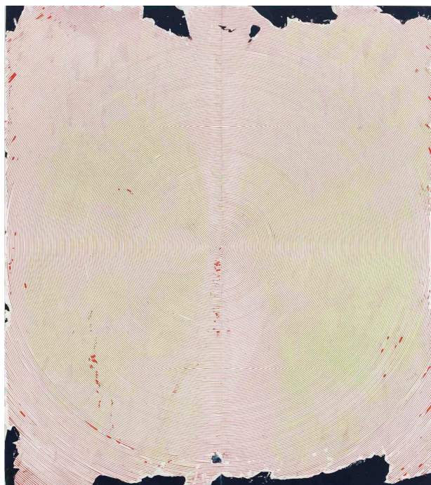
Sans titre , 2016