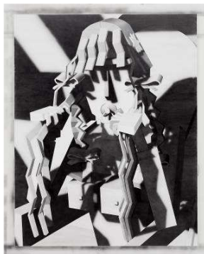
Heidiland, 2014