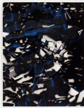
Untitled , 2016