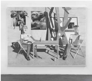
The Studio Visit, 2012

Her work has enjoyed remarkable institutional recognition for an artist of her young years, with exhibitions at kunsthallen, biennials (Lyon, New York) and public collections in Europe (Museum Ludwig, Cologne, Stedelijk Museum, Amsterdam) and America (MoMA, Whitney Museum, Hammer Museum).