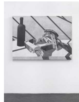
Saturday Night, 2014