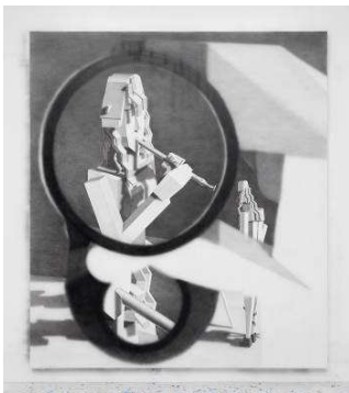
Director, 2014